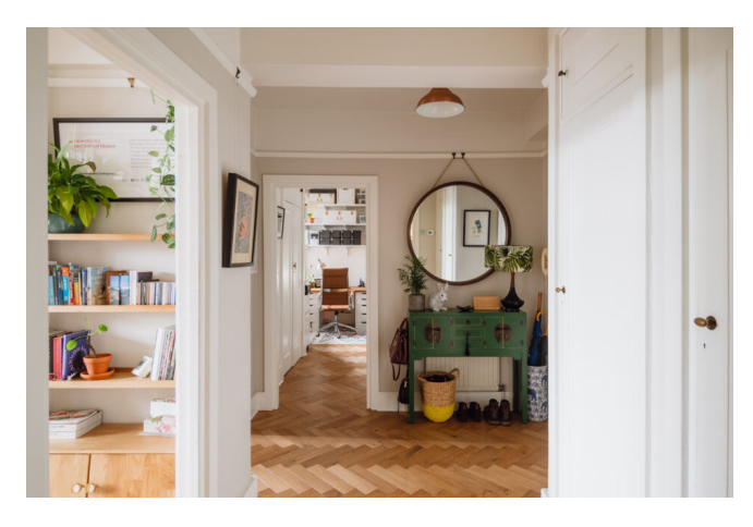
London, South London Sold