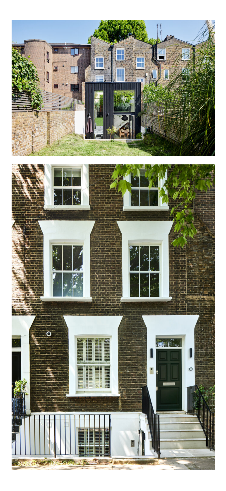
London, South London Sold