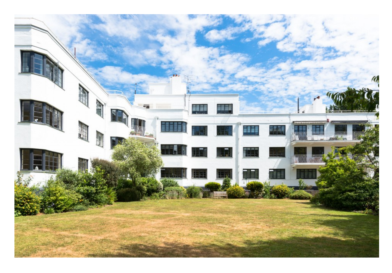
Millfield Lane, London N6