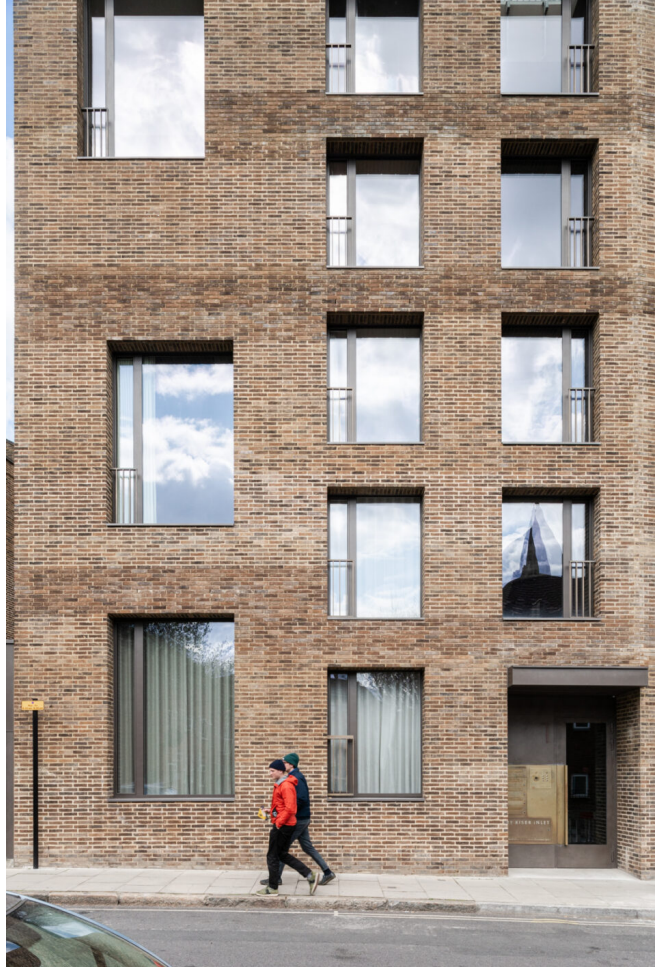
London, North London Sold