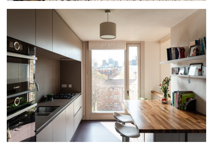
London, North London Sold