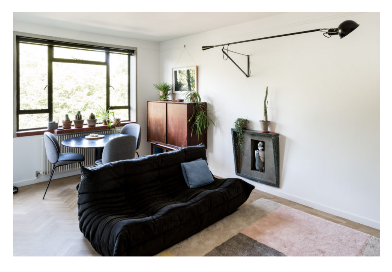
Rosebery Avenue, Spa Green Estate, London EC1