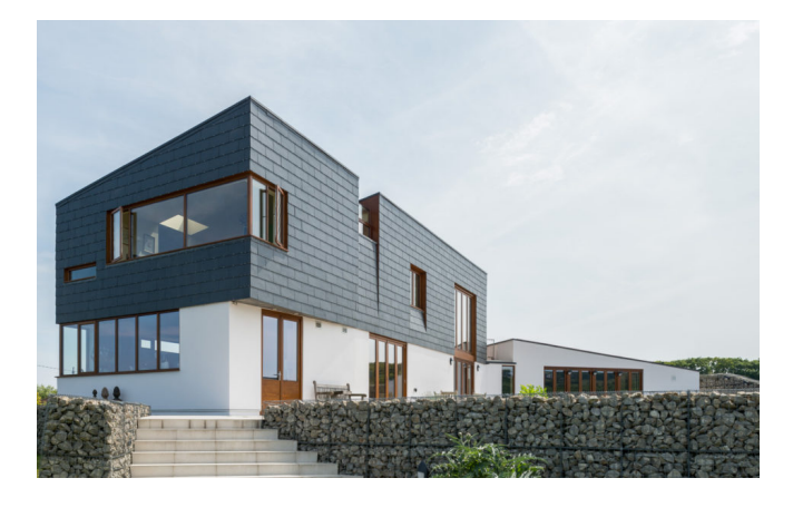
South-East England Sold