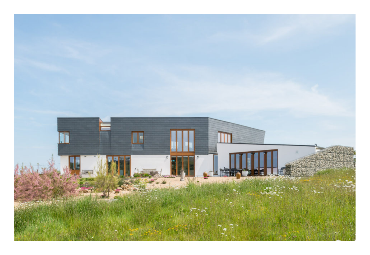
Fairlight, East Sussex