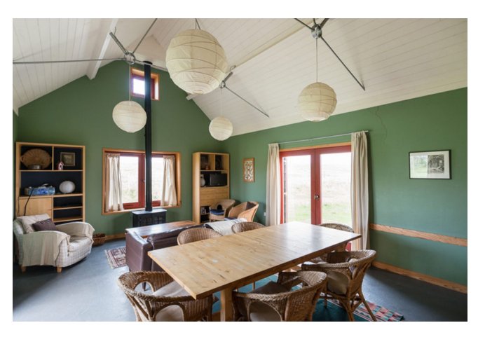
East Anglia Sold