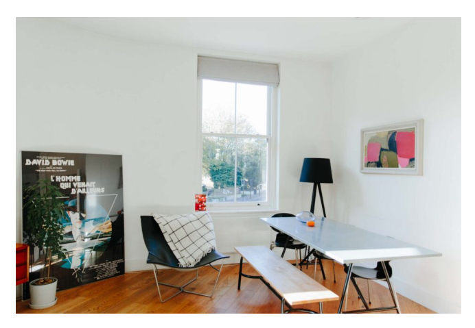
London, South London