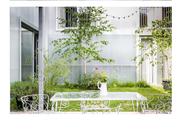
London, South London