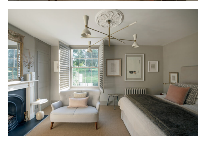
South-West England Sold