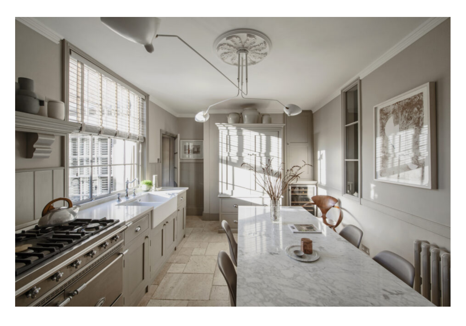
Ledbury, Herefordshire Sold