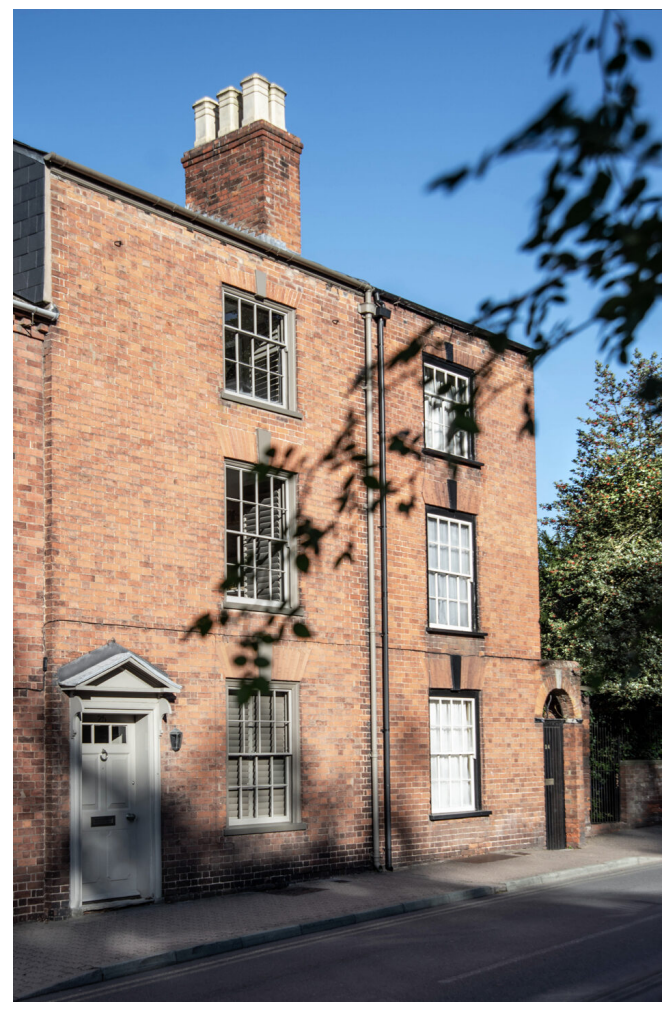
South-West England Sold