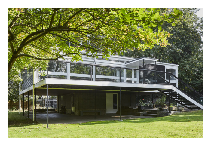
London, North London