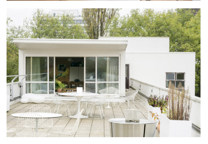
London, North London Sold