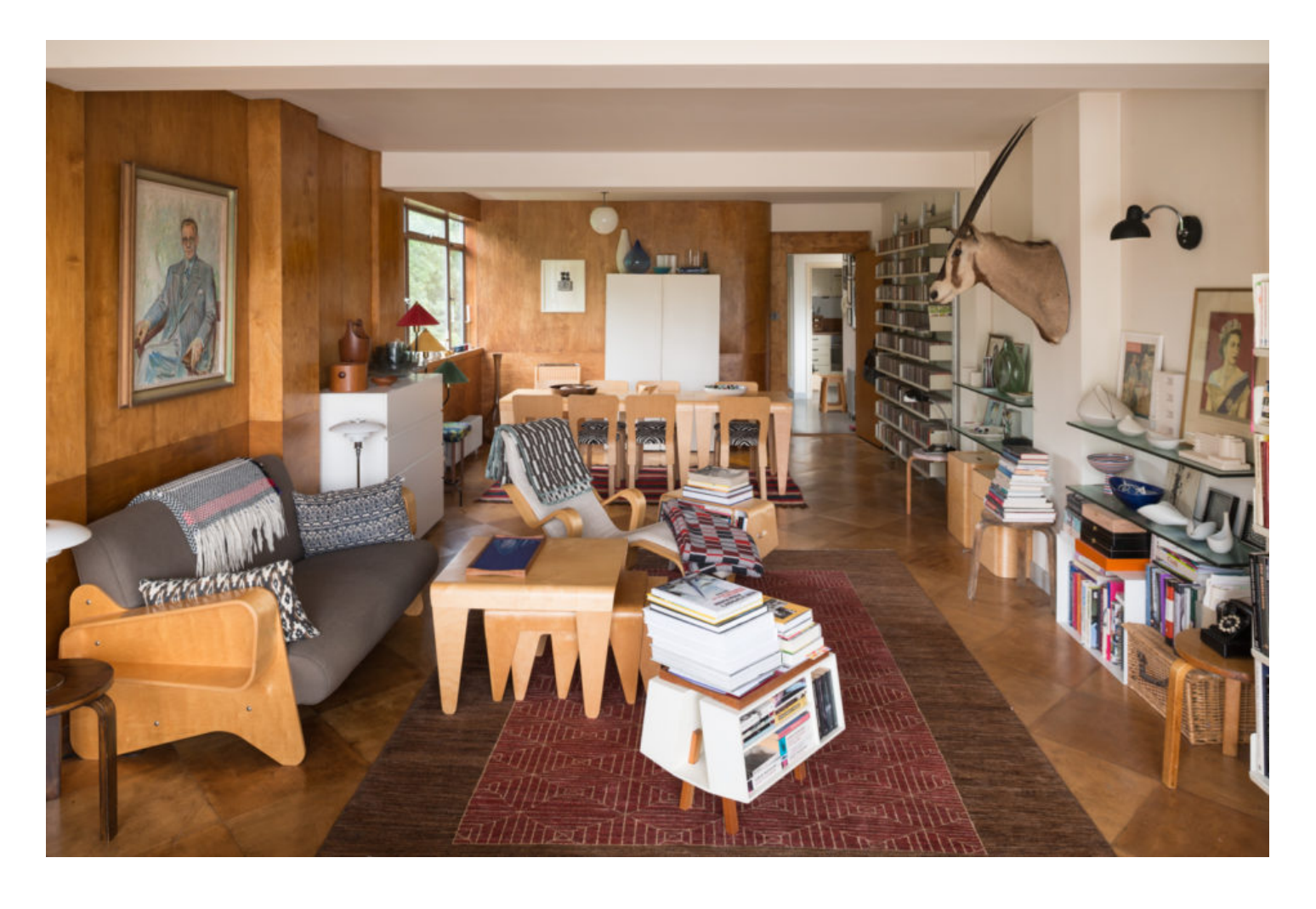
Isokon Building, Lawn Road, London NW3