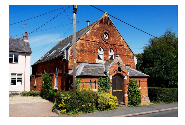
East Anglia, South-East England Sold