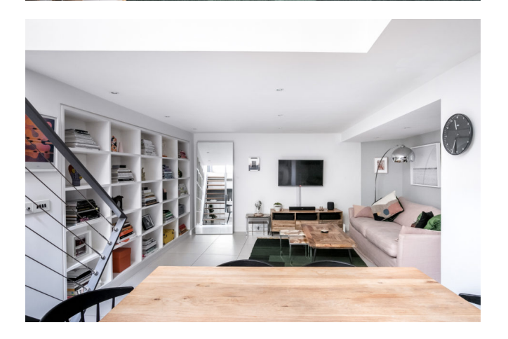
London, South London