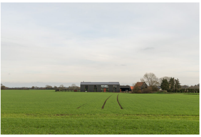
East Anglia Sold