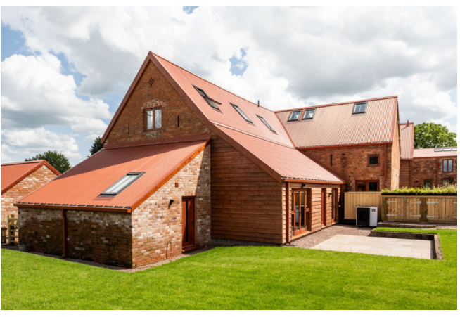
Midlands £695,000 Freehold