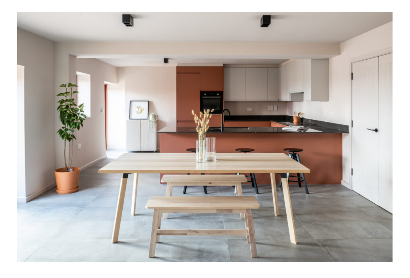
The Parks, Canon Pyon, Herefordshire £695,000 Freehold