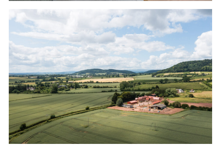
Midlands £695,000 Freehold