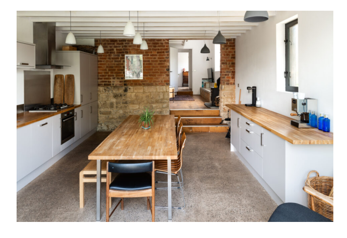
South-West England Sold