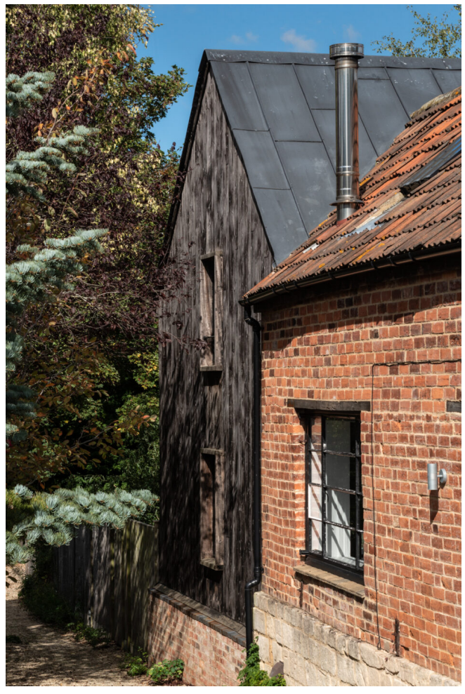
South-West England Sold