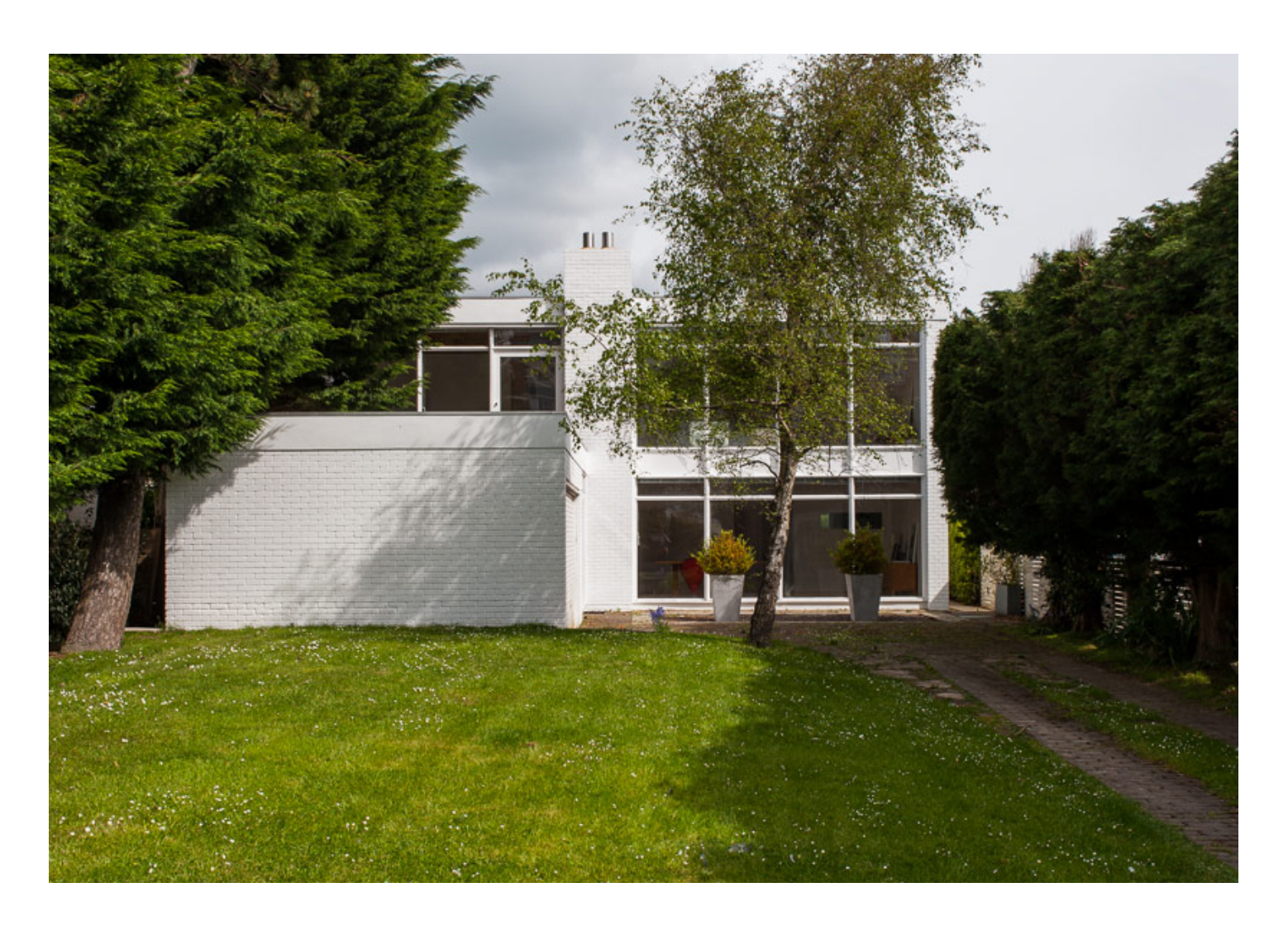
Hayling Island, Hants Sold