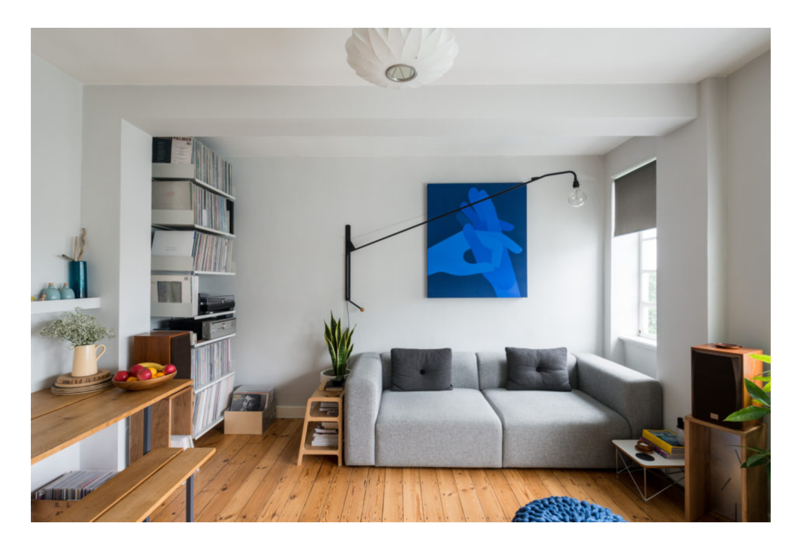
Taymount Rise, London SE23 Sold