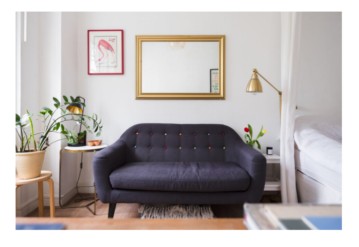
London, South London £285,000 Leasehold