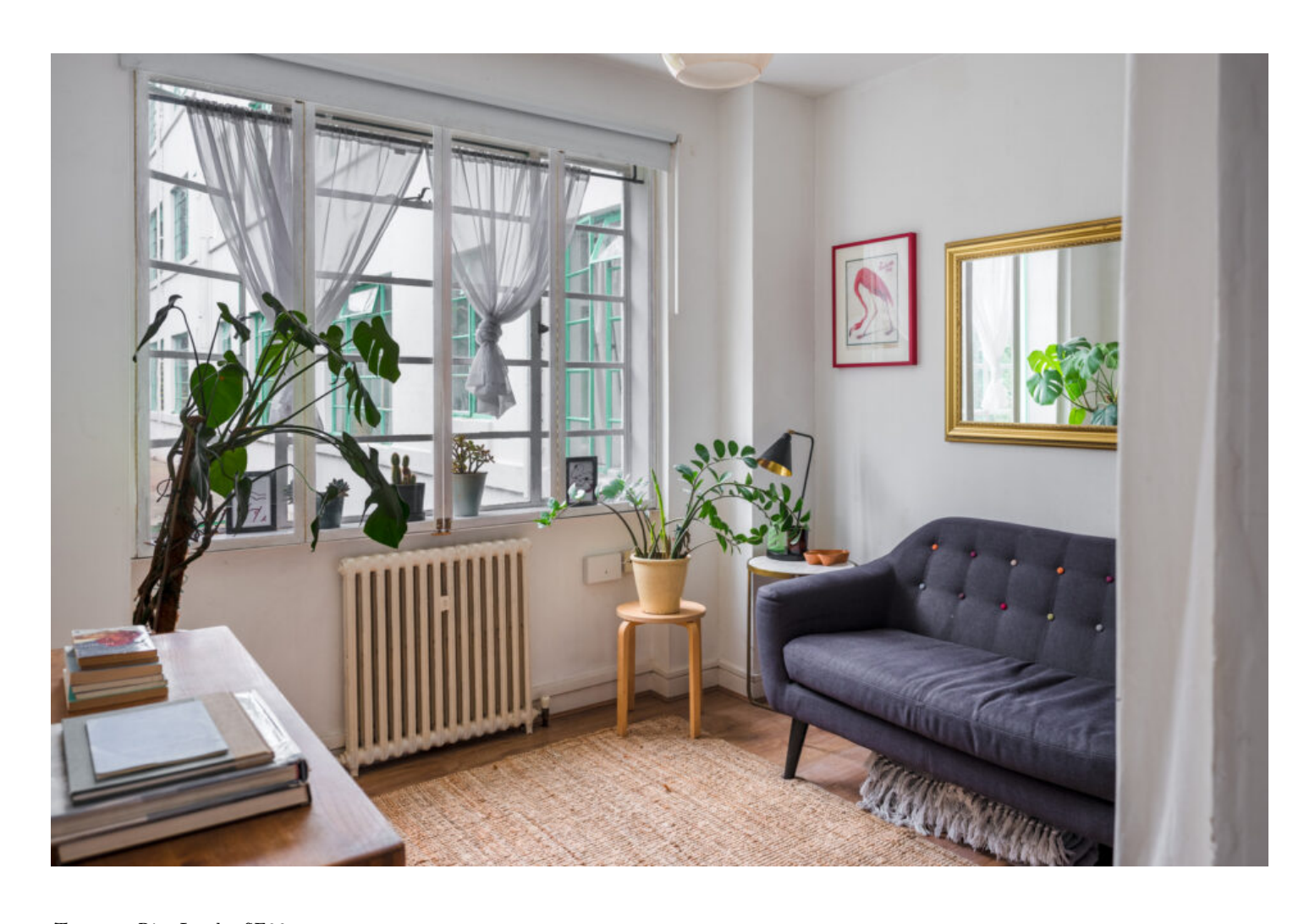
Taymount Rise, London SE23 £285,000 Leasehold