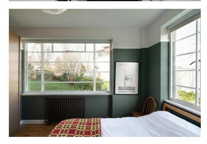
London, South London £480,000 Leasehold