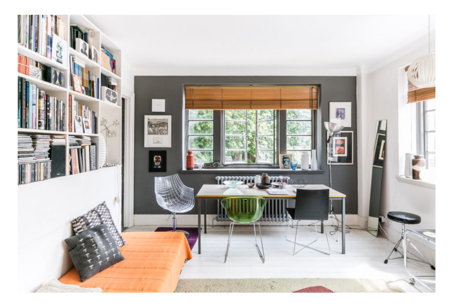
Tavistock Square, London WC1 Sold