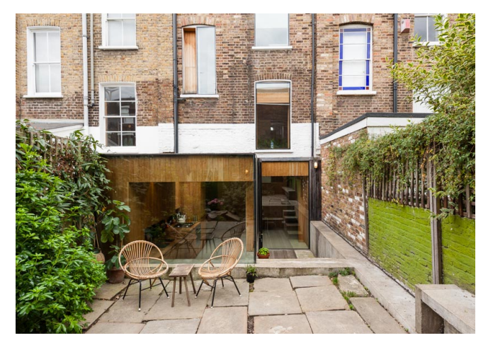
London, North London