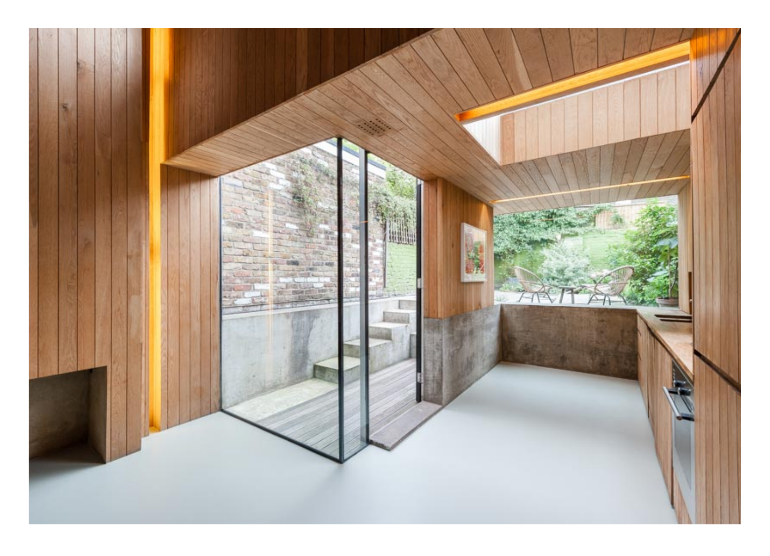
Bevan Street, London N1 Sold