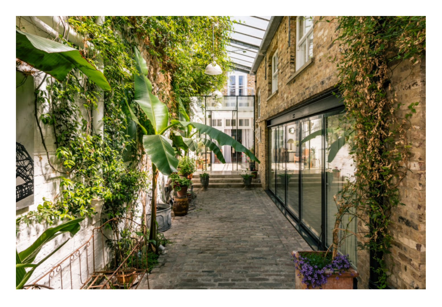
Chepstow Road, London W2