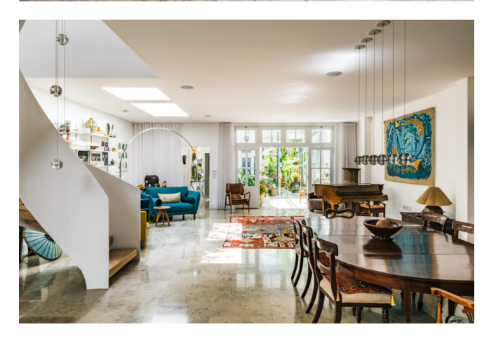
London, West London