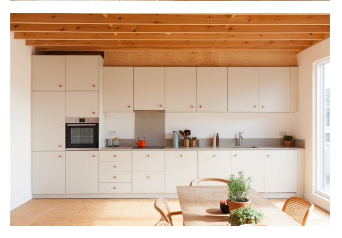
East London, London Sold