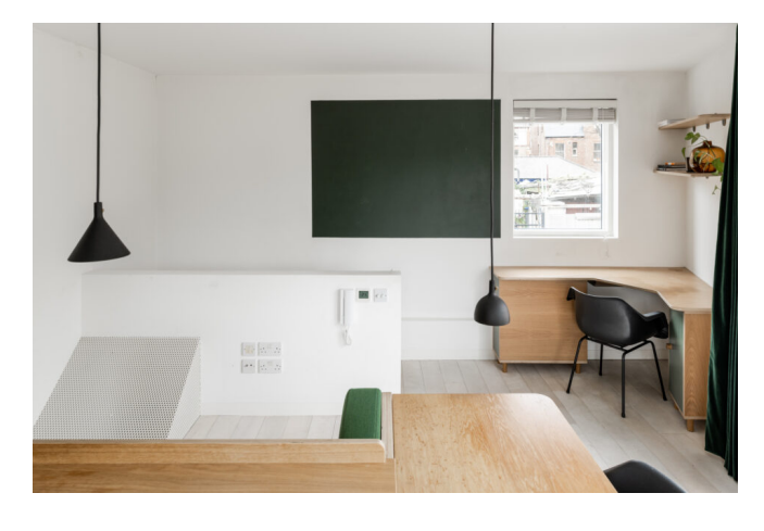
East London, London