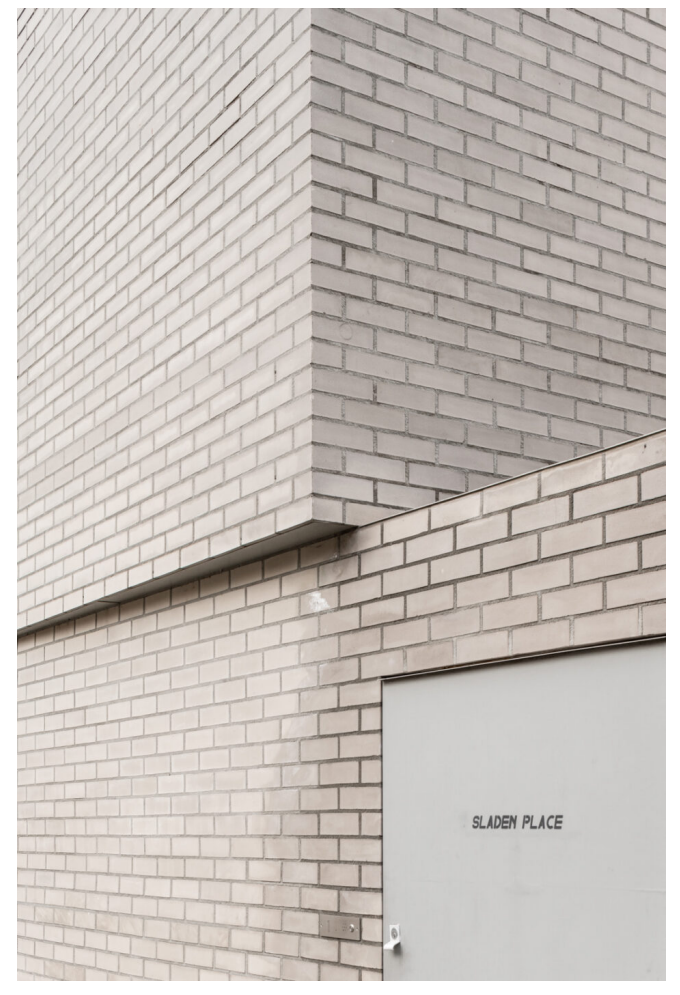
{\it East London, London} \\ {\it Sold}