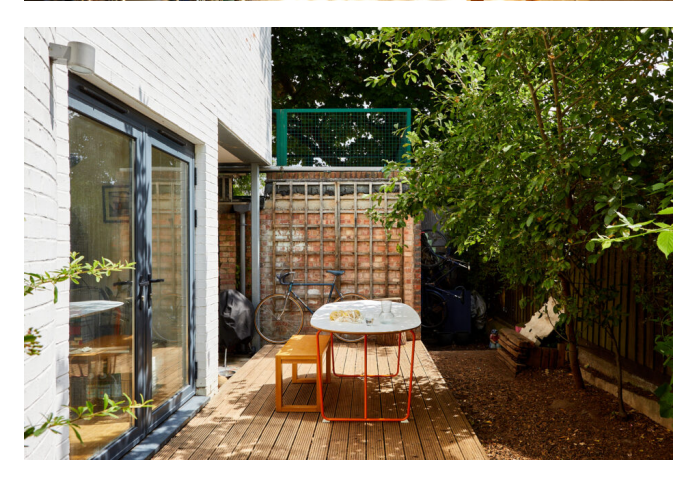
London, South London