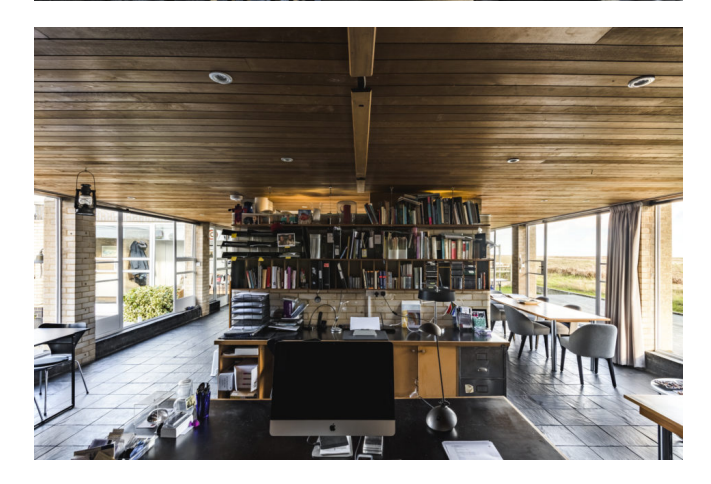
East Anglia Sold