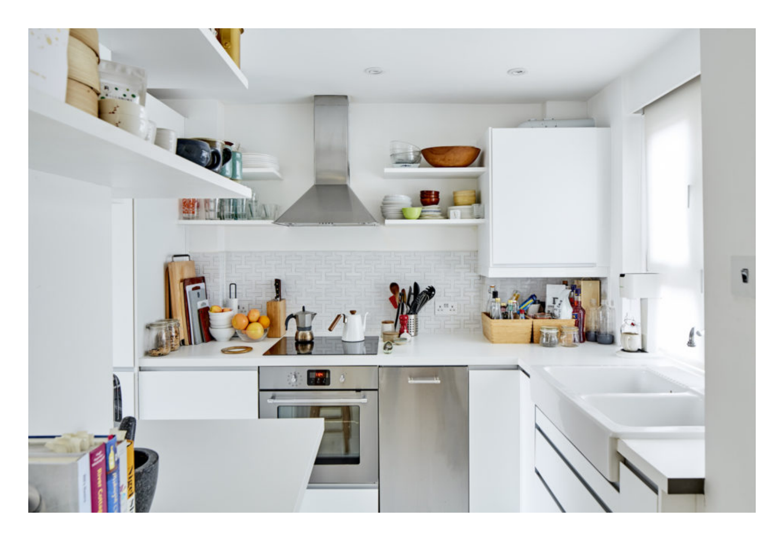
Warner Place, London E2 Sold