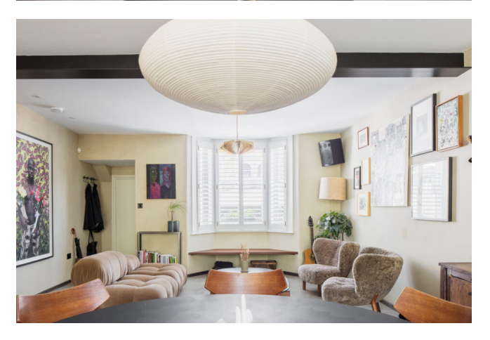
East London, London