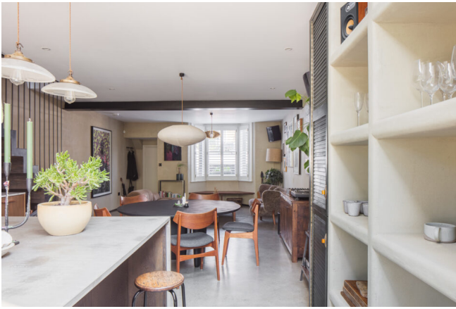
East London, London Sold