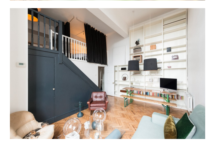
East London, London Sold