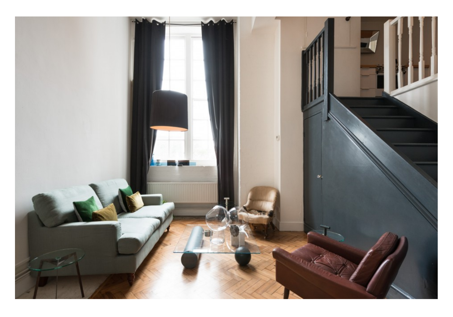
Arbery Road, London E3