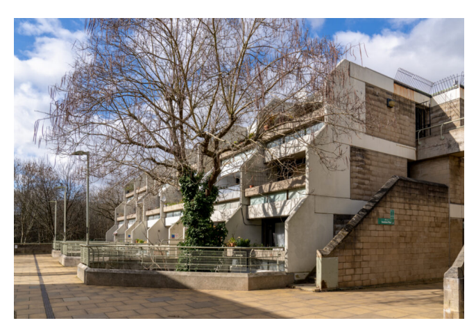
London, North London Sold