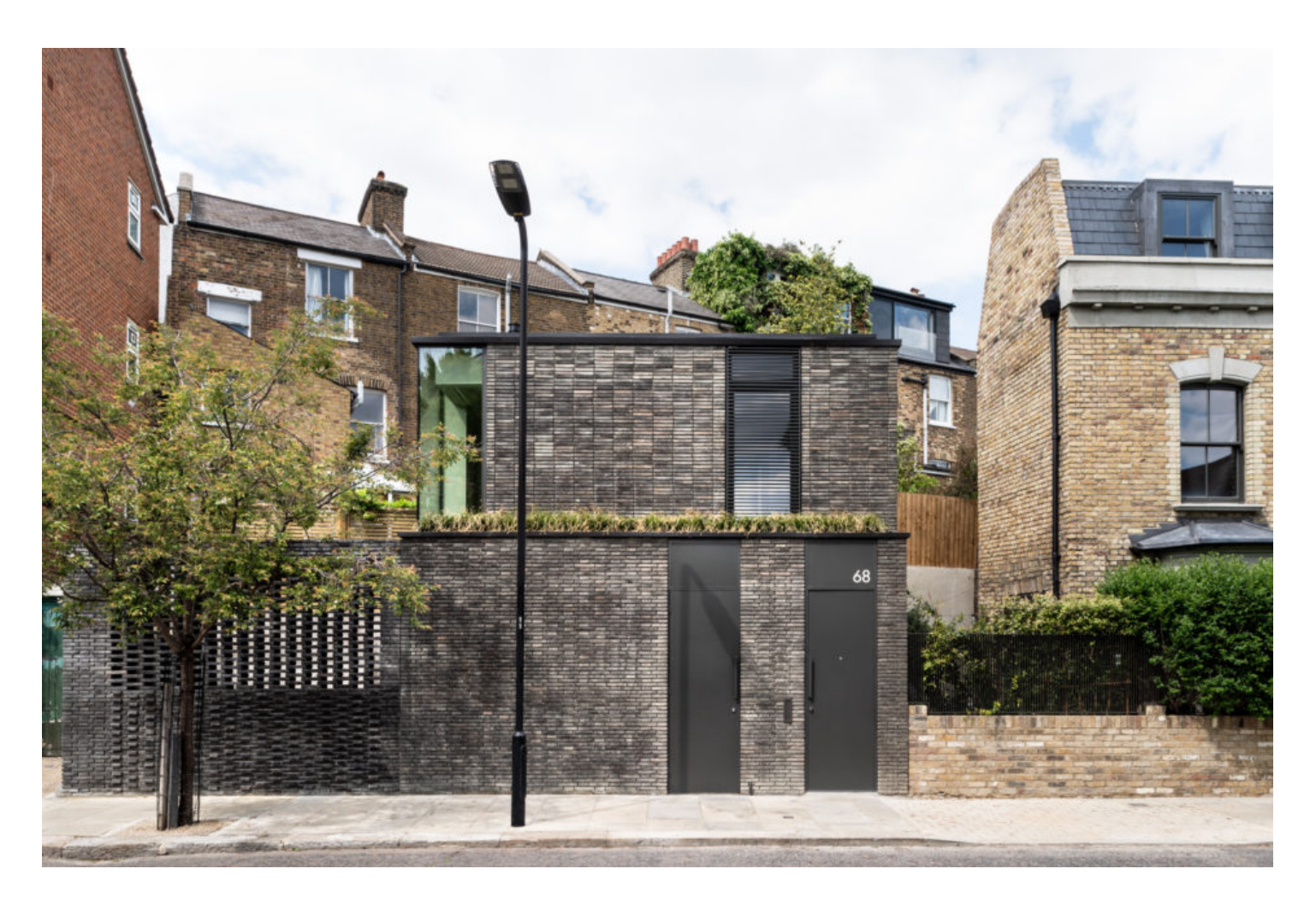
Sandbrook Road, London N16 Sold