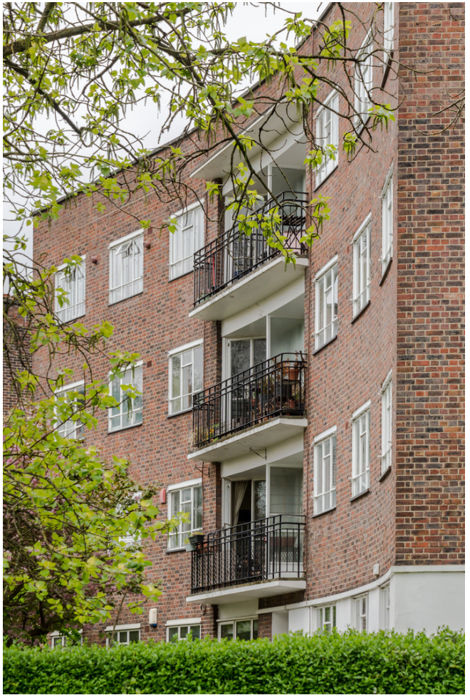
South London £585,000 Share of Freehold