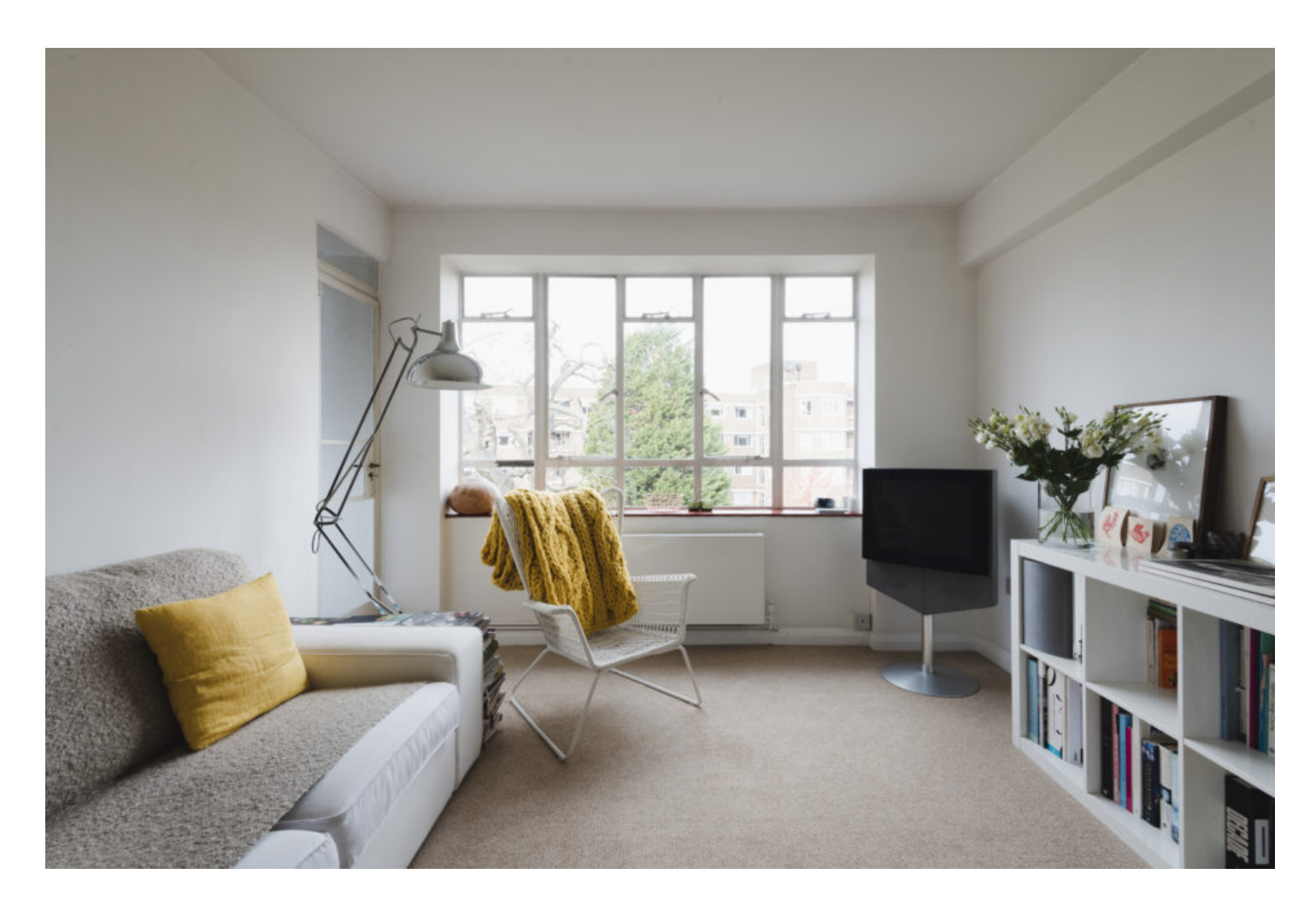
Champion Hill, London SE5 Sold