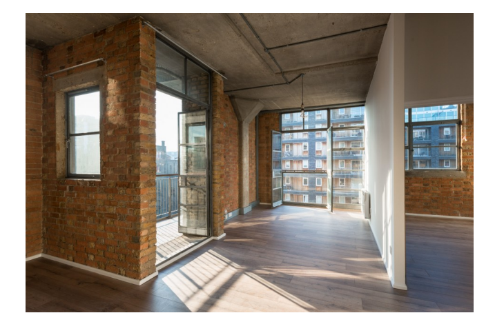
London, North London Sold