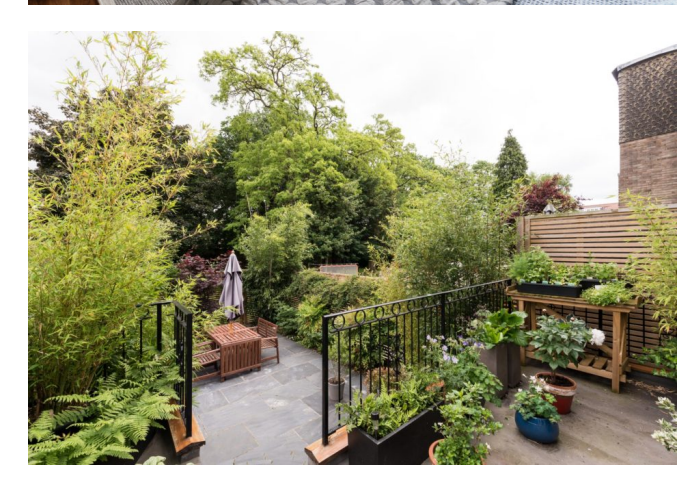
London, South London Sold