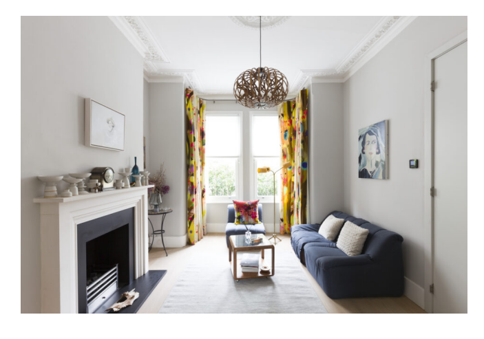
London, South London