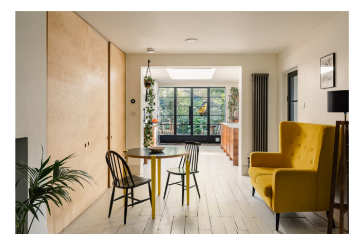
London, South London £1,750,000 Freehold