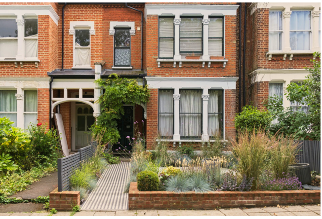
London, South London £1,750,000 Freehold