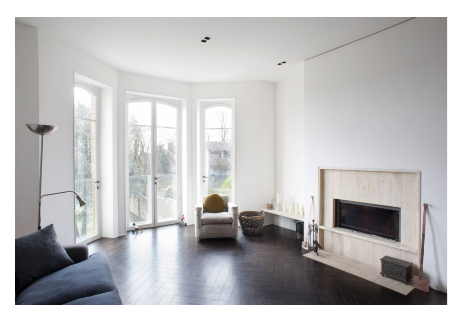
Grove Park, London SE5 Sold