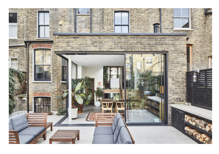
London, North London Sold