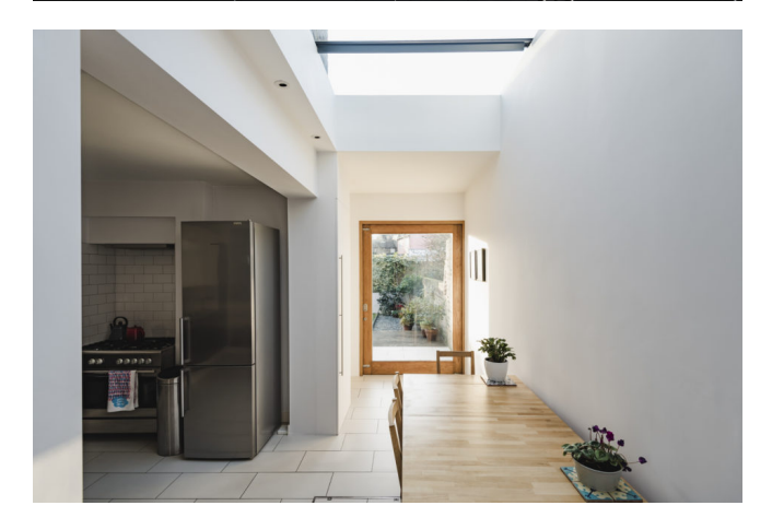
London, South London