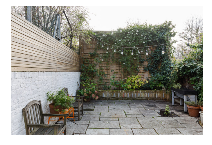
London, South London Sold