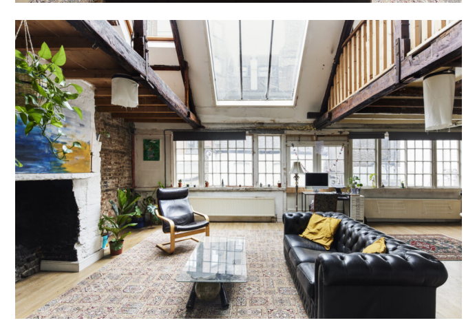
London £2,300,000 Freehold