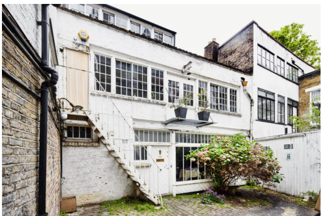
London £2,300,000 Freehold