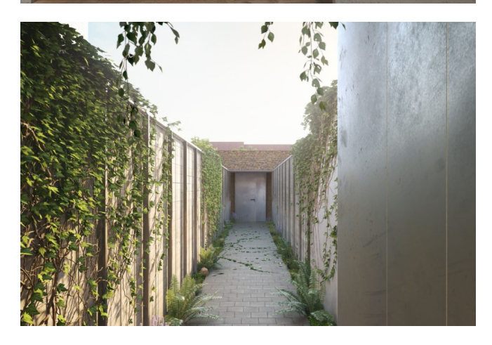
East London, London £365,000 Freehold (Land only with planning)