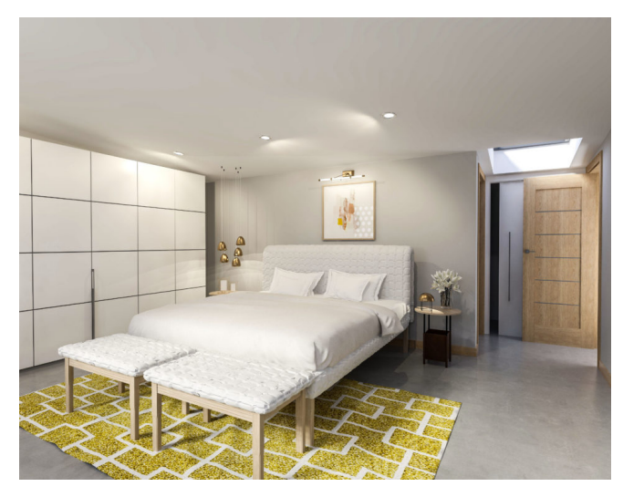
South-East England, South-West England £1,200,000 Freehold