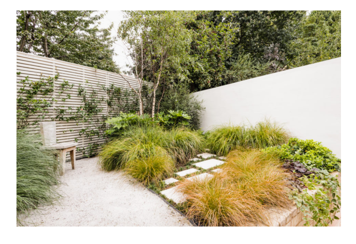
East London, London Sold