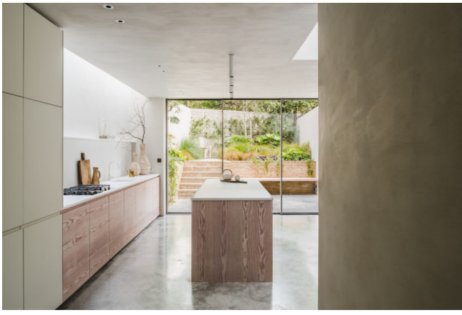
East London, London Sold