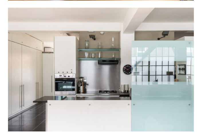
London, North London Sold