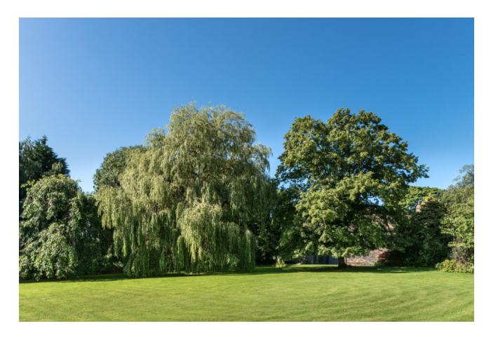
North England Sold