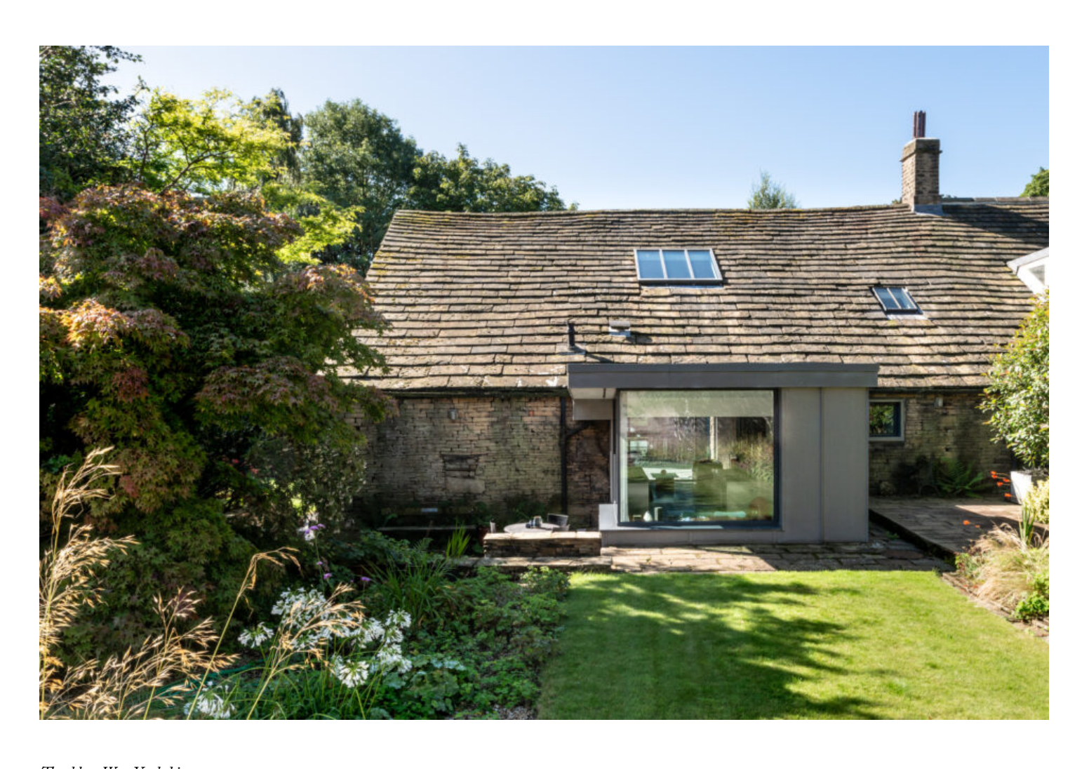
Thackley, West Yorkshire Sold