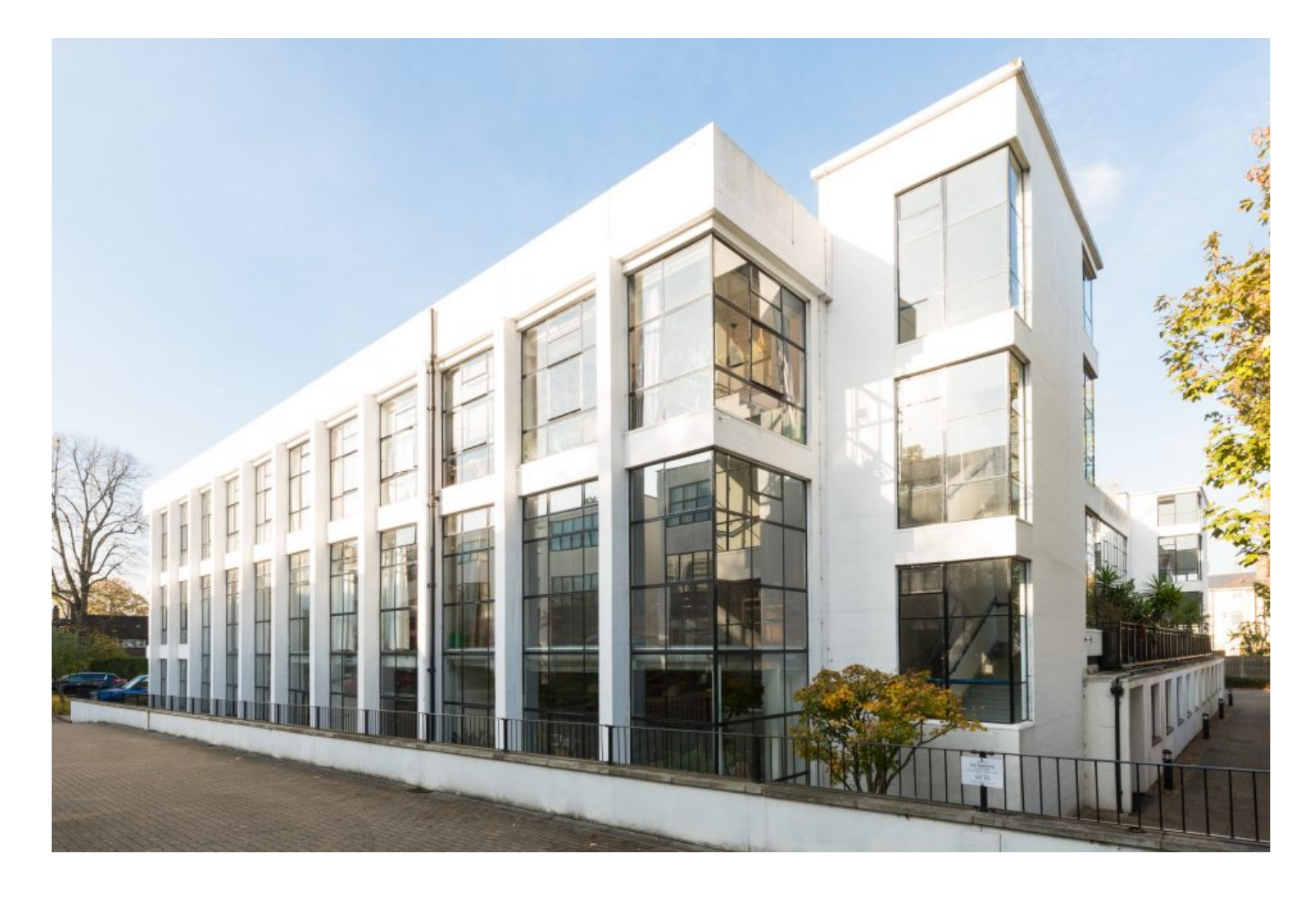
St Mary's Road, London SE15 Sold